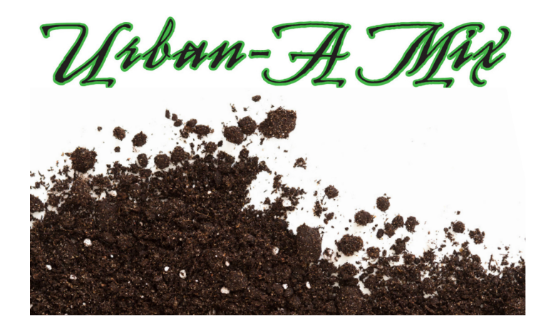
Urban-A Mix - ACWUMA2.8CF FOF20 - FFOF203CF FOF30 - FFOF303CF

Fafard has recently released an organic line of soil. American Clay stocks FOF20 and FOF30 and other mixes are available in pallet quantity by request. These mixes meet all National Organic Program guidelines. Urban-A Mix, exclusively designed by and produced for American Clay is a blend of Peat Moss, Coco Coir, Large Perlite, an Organic Wetting Agent, Mycorrhizae, and Vermicmpost. This is a great general purpose mix. FOF20 contains Canadian Sphagnum Peat Moss, Perdue Organic Fertilizer, Perlite and Vermiculite. It is a great propagation mix for seeds, cutting and liners. FOF30 contains Canadian Sphagnum Peat Moss, Aged Pine Bark, Perdue Organic Fertilizer, Perlite and Vermiculite. It is a great general purpose mix for greenhouse-grown plants in containers or hanging baskets.